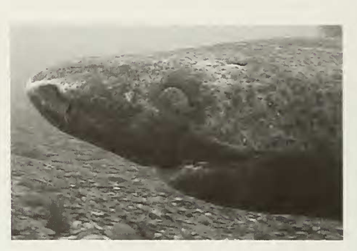
FIGURE 2. The rostrum of a female Greenland Shark illustrating typical loss of pigmentation seen anterior and adjacent to prominent nares. The cornea lacking attached parasitic copepods, and the dorsal operculum are clearly visible.

Of the 10 shark encounters, the range in estimated length was from 2.5 to 4.5 m total length (mean = 2.8 m +/- 0.34 m CI 95%). In four sharks sex was determined (3 female, 1 male), with one markedly "girthy" 3.0 m female shark believed to be gravid. In one instance three sharks were seen separately on the same dive and in one instance two sharks were observed simultaneously within 5 meters of each other on diverging courses. Shark swimming speeds ranged from 0.10 m/s to peak at 1.40 m/s (mean = 0.62 m/s +/- 0.31 m/s 95% CI). Greenland Sharks were capable of rapid acceleration from 0.10 m/s to 1.40 m/s and could outpace divers when swimming in a straight line, were highly manoeuvrable and were capable of changing depth and direction rapidly. In one case, the same 2.50 m female shark identified by scar patterns was seen repeatedly over a 3-day period in the same location, in each case within 50 m of the same position when encountered. Female sharks were noted to have more scarring than males, generally linear scarring on the tail, pectoral fins and dorsum of the caudal peduncle. We postulate that these scars may have resulted from nuptial or combat related behaviour, as observed in other shark species (Compagno 1984).